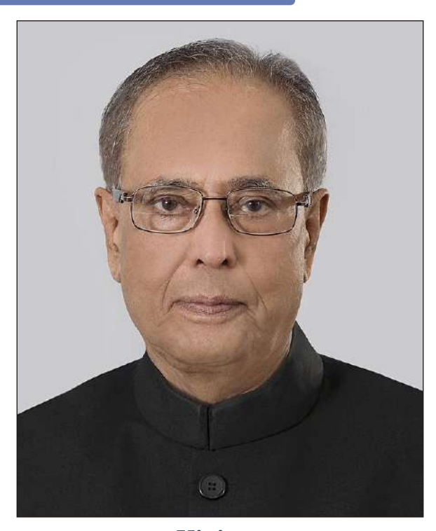
Visitor Shri. Pranab Mukherjee Hon'ble President of India